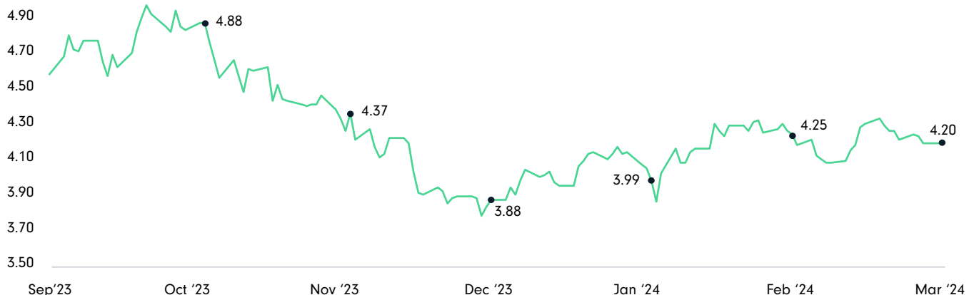
Exhibit 1 – 10-Year Treasury Yield (%)